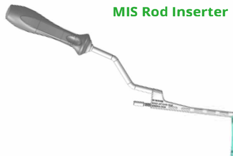
MIS Rod Inserter

Square thread design to prevent cross-threading